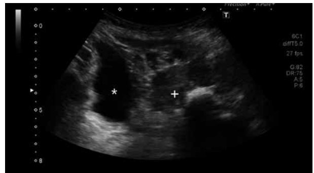
Figure 1. Ultrasound image of the left retroperitoneal pelvic solid mass (marked by +), causing right bladder deviation (marked by *).

of significant hematological toxicity, maintenance chemotherapy was prematurely interrupted. He completed treatment for the venous thromboembolism with low molecular weight heparin. One year later, a new-onset right hemiparesis with brachial predominance led to the diagnosis of a single left parietal brain rhabdomyosarcoma metastasis, which was removed, with subsequent clinical recovery and no residual lesion in the control magnetic resonance imaging (MRI). A few months later, a locoregional recurrence was diagnosed, with progressive edema of the left lower limb and scrotum. The patient died due to disease progression.